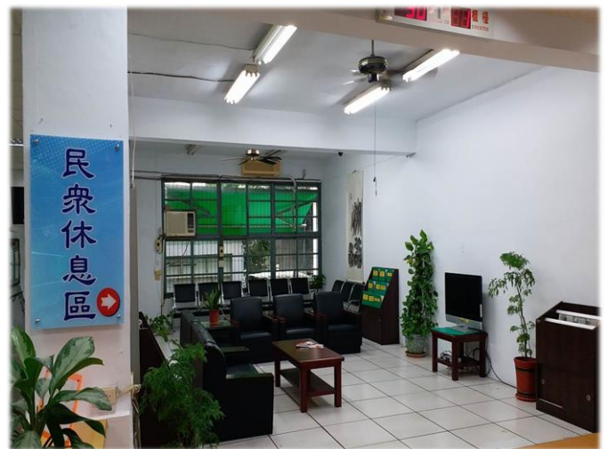
Applicant waiting area