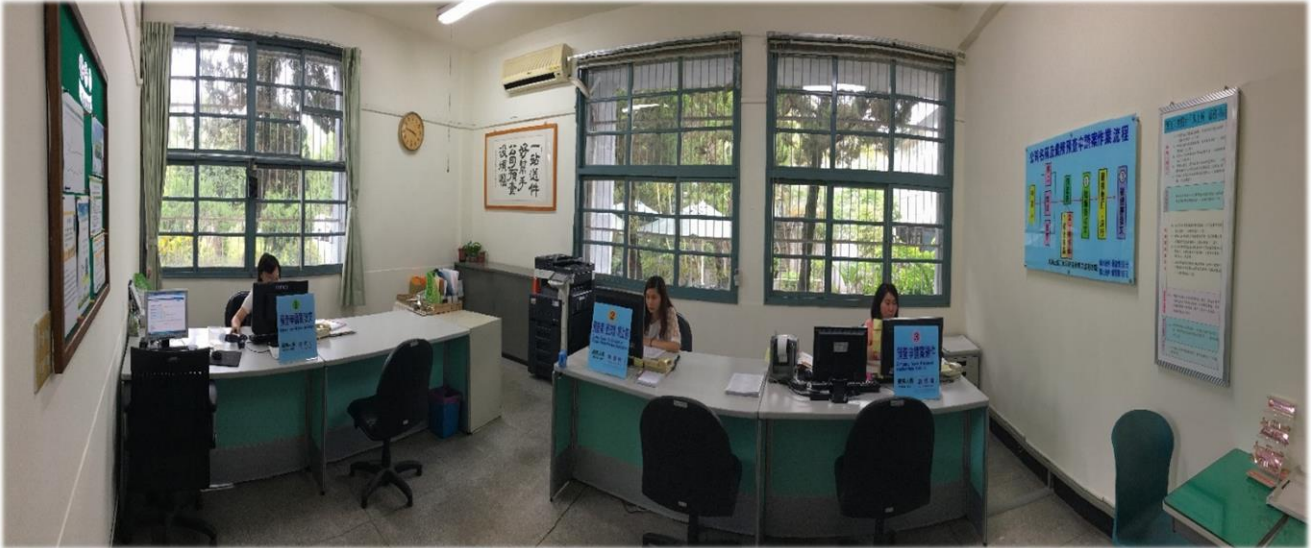
Applicant reception area