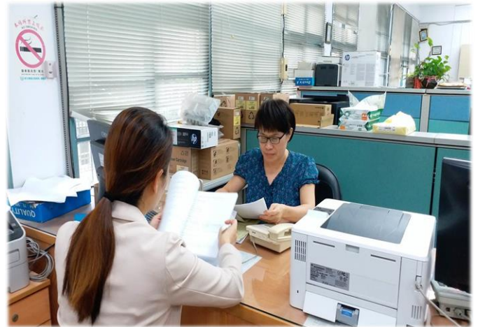
Applicant reception area